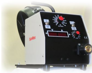
SANFEED SKY 4 & 4HD