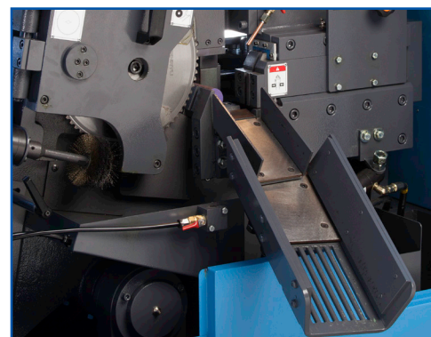
Close up of material chute