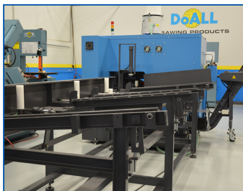
Bar loader table