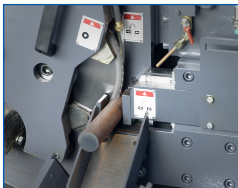
Sample of solid round being cut