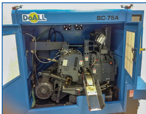
SC-75A Front with doors open