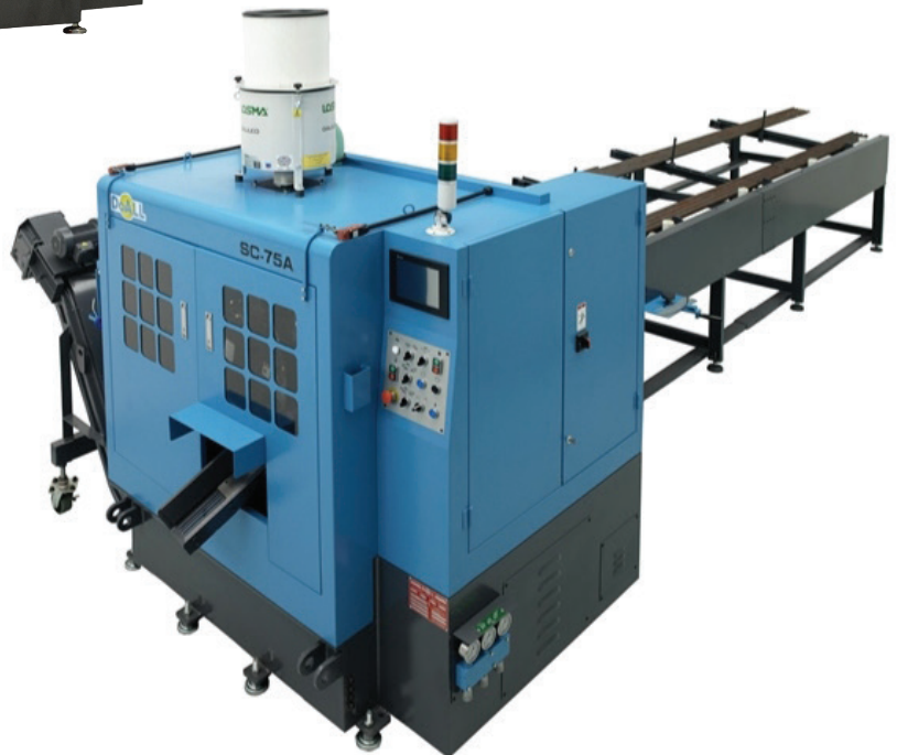
DoALL SC-75A Circular Saw – 3" Round Capacity

Circular saws offer automatic operation, numerical control and features solid heavy-duty construction which provides more rigidity and reduces vibration for higher cutting rates, exceptional accuracy, superior surface finish and increased blade life.