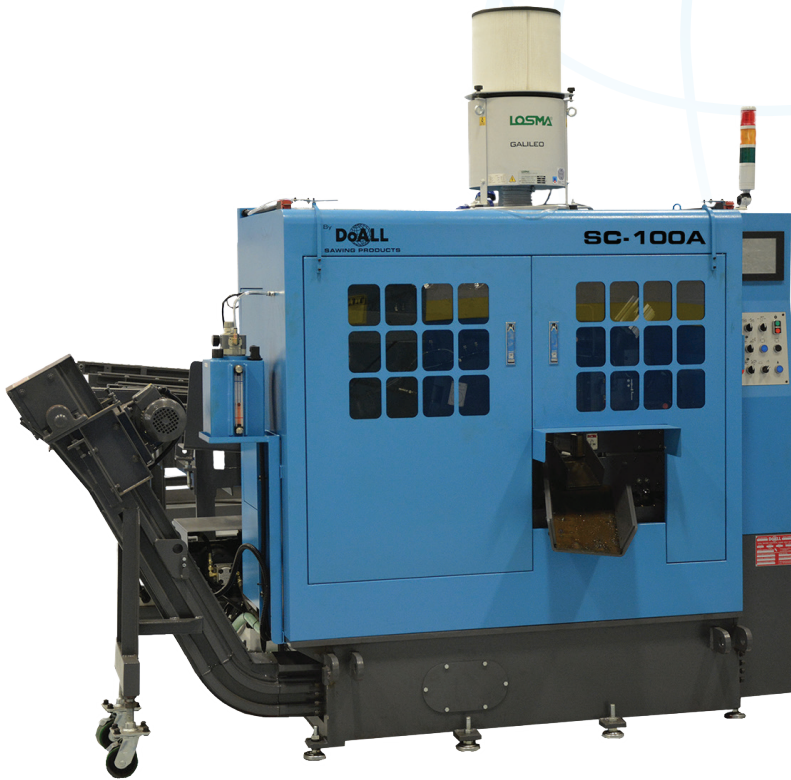
DoALL SC-100A Circular Saw – 4" Round Capacity