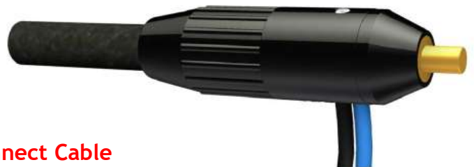
Coaxial Interconnect Cable

Gas, Power and Control cable in one heavy duty one piece easy to connect coax cable.